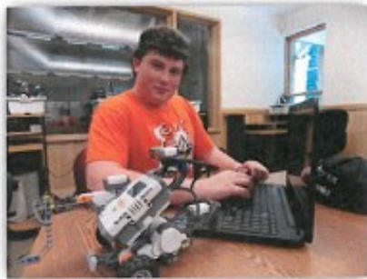
Robotics merit badge was added in 2014 through a $12,000 investment in technology

MORAINES TRAILS COUNCIL Boy Scouts of America